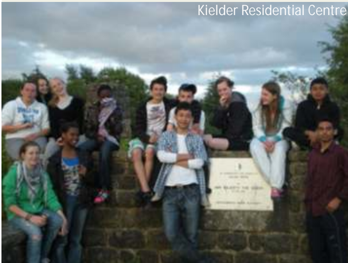
Kielder Residential Centre