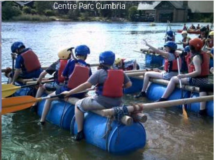
Centre Parc Cumbria