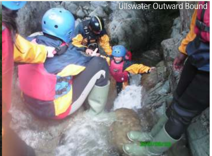
Ullswater Outward Bound

Excelsior pupils have had the opportunity to take part in a number of productions and performances throughout the year. Some have taken place within their schools others have been Academy wide and include Remembrance Service, Christmas Production, Arts Exhibition and Fashion Show, Creative Arts Performance for families and governors, as well as this year's outstanding Annual Summer performance of Hairspray.