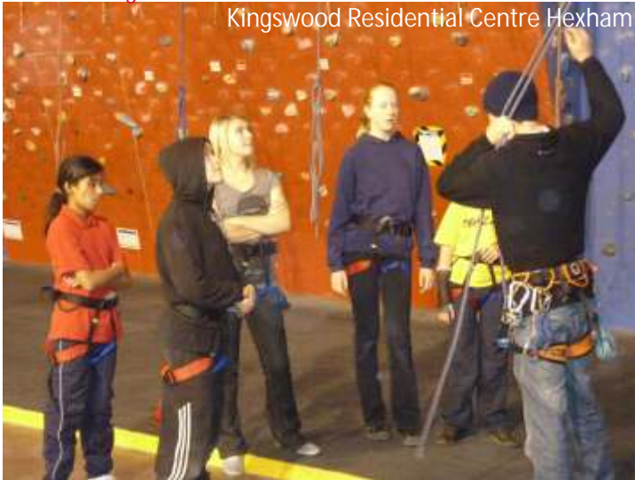
Kingswood Residential Centre Hexham