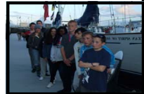
Excelsior at Sea