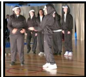
Above left: Fashion Models prepare for Catwalk. Above right: Demolition Dancers rehearse.