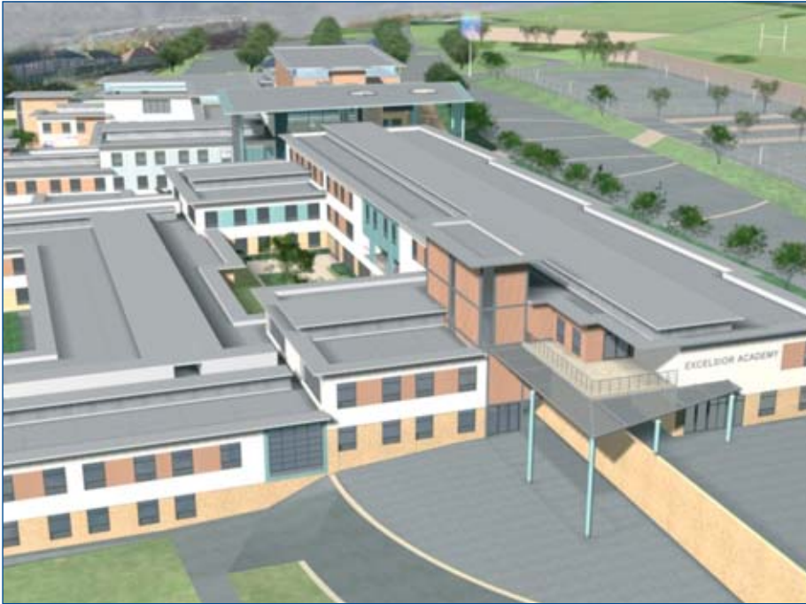
View of how Excelsior will look from Broadmead Way.