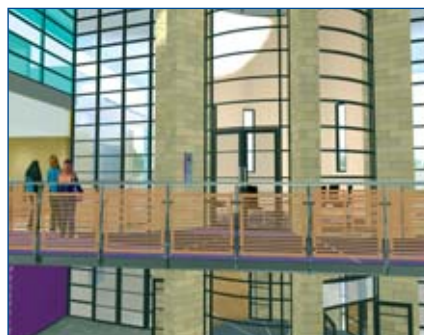
Interior view of the main entrance area.

The curriculum in each school at Key Stage 3 (years 7 and 8) will be broadly similar. There will be a strong emphasis on the development of core subjects - English, Mathematics and Information Technology -