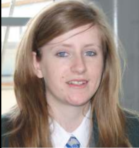
Newcastle Evening Chronicle - May 26th 2011

A TYNESIDE schoolgirl has reached the final of a national competition.